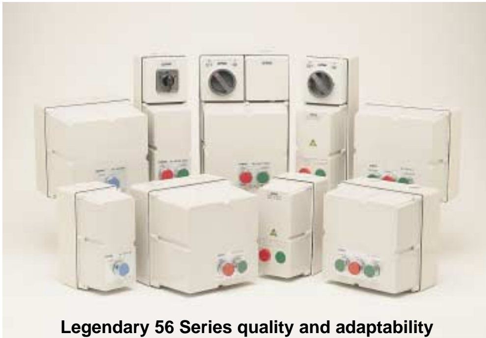
Legendary 56 Series quality and adaptability